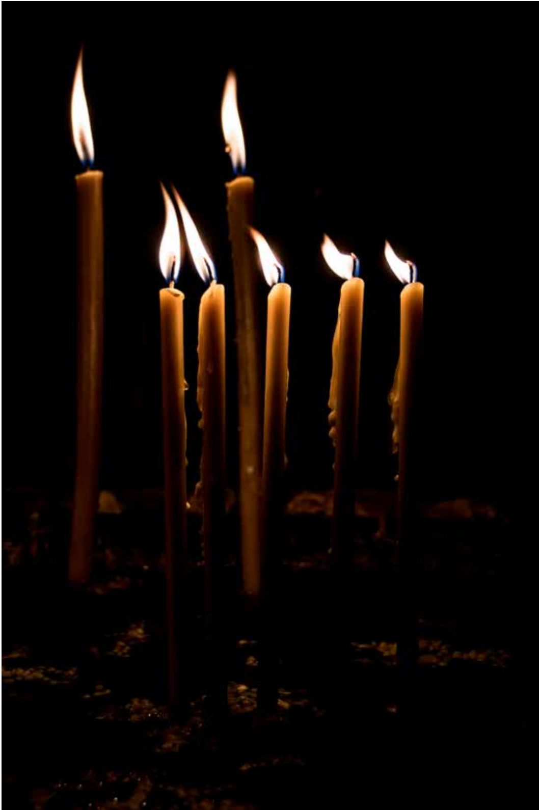
15. St. Nikola Church, Kotor, Montenegro (2016)