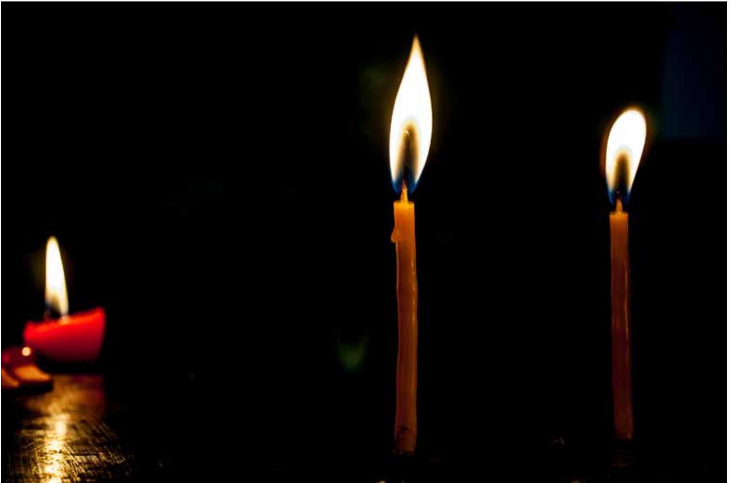
8. Metropolitan Cathedral, Guatemala City, Guatemala (2012)