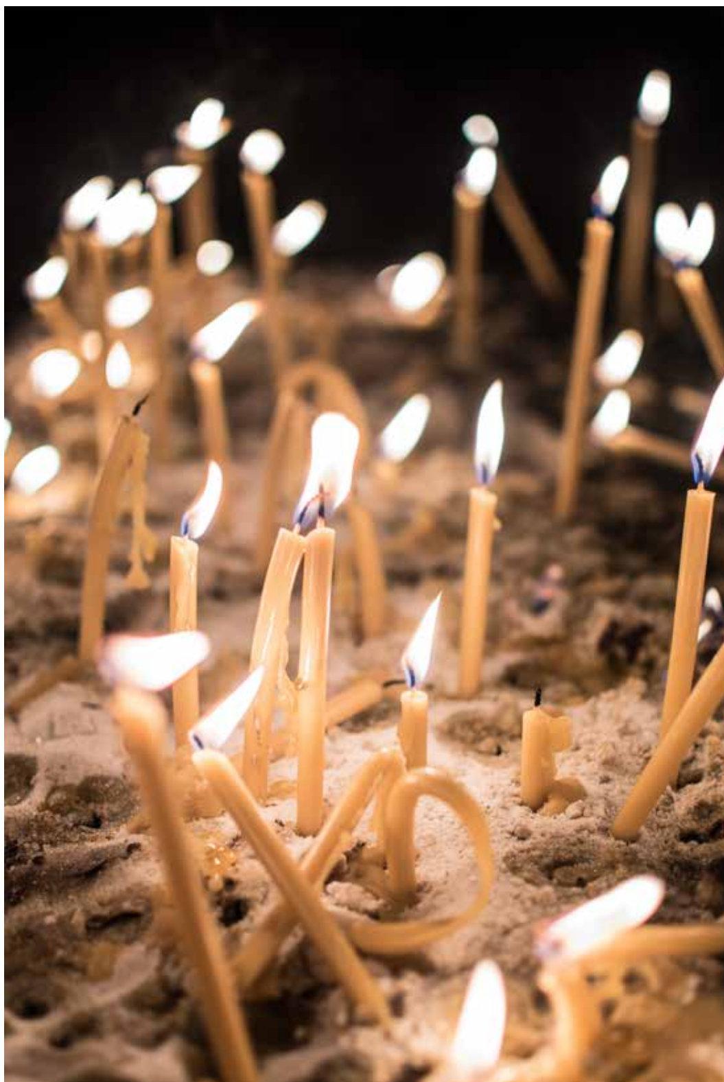
2. St. Stephen's Cathedral, Vienna, Austria (2016)