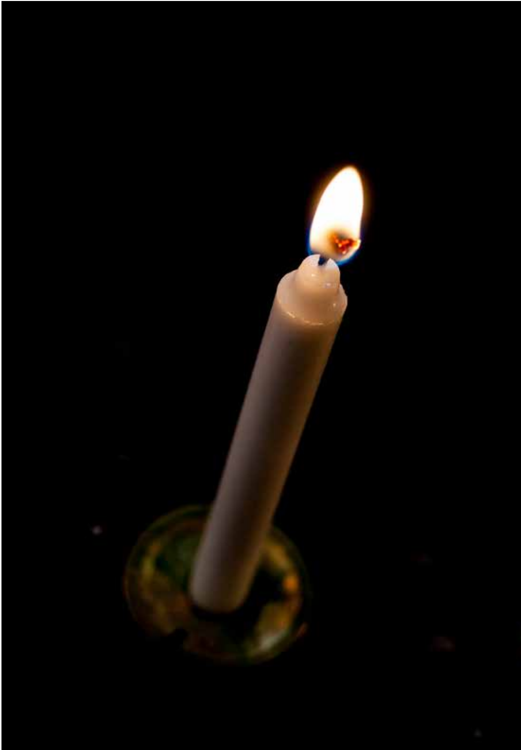
16. Tromso Cathedral, Tromso, Norway (2015)