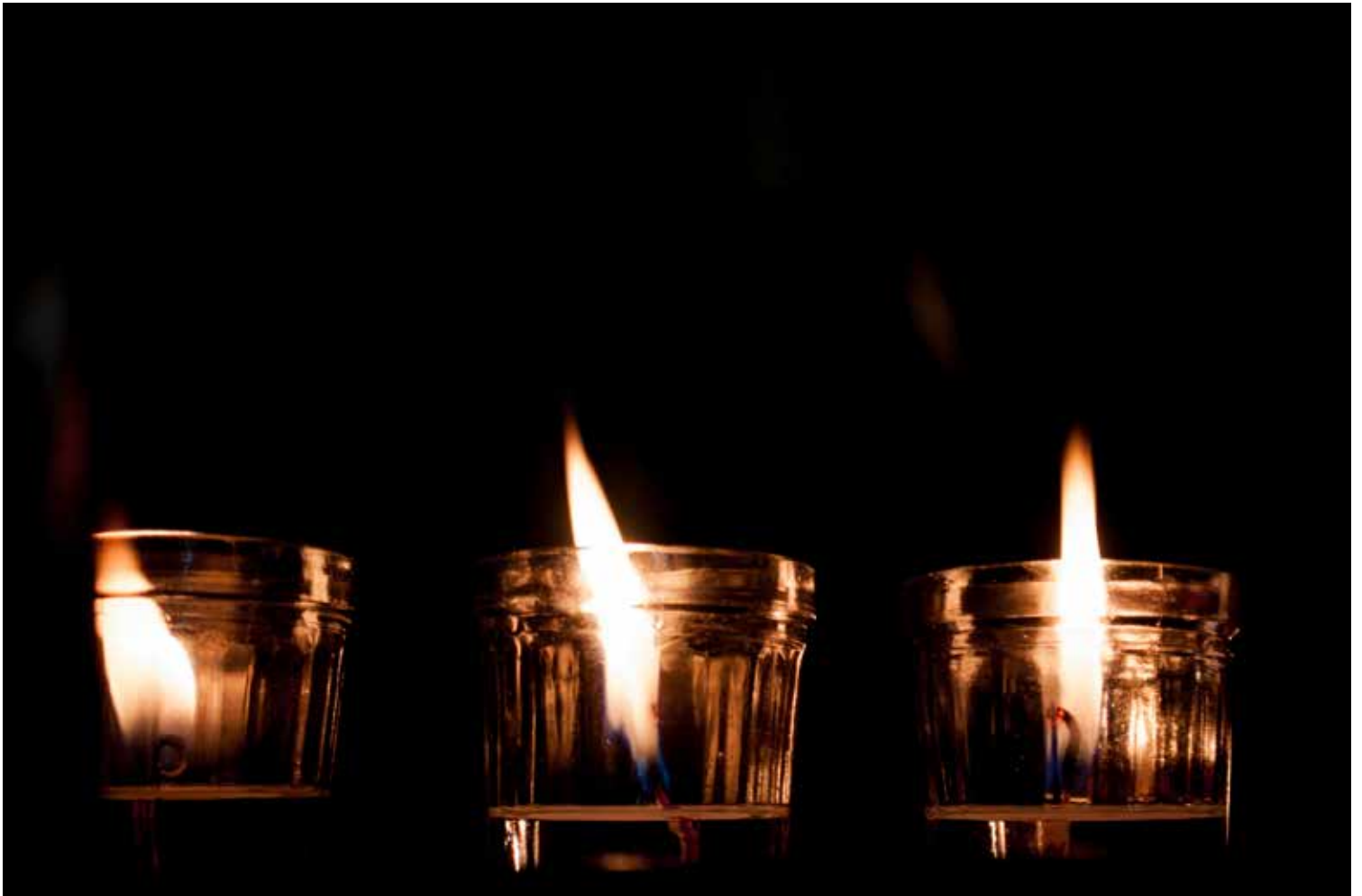
4. Metropolitan Cathedral, Guatemala City, Guatemala (2012)