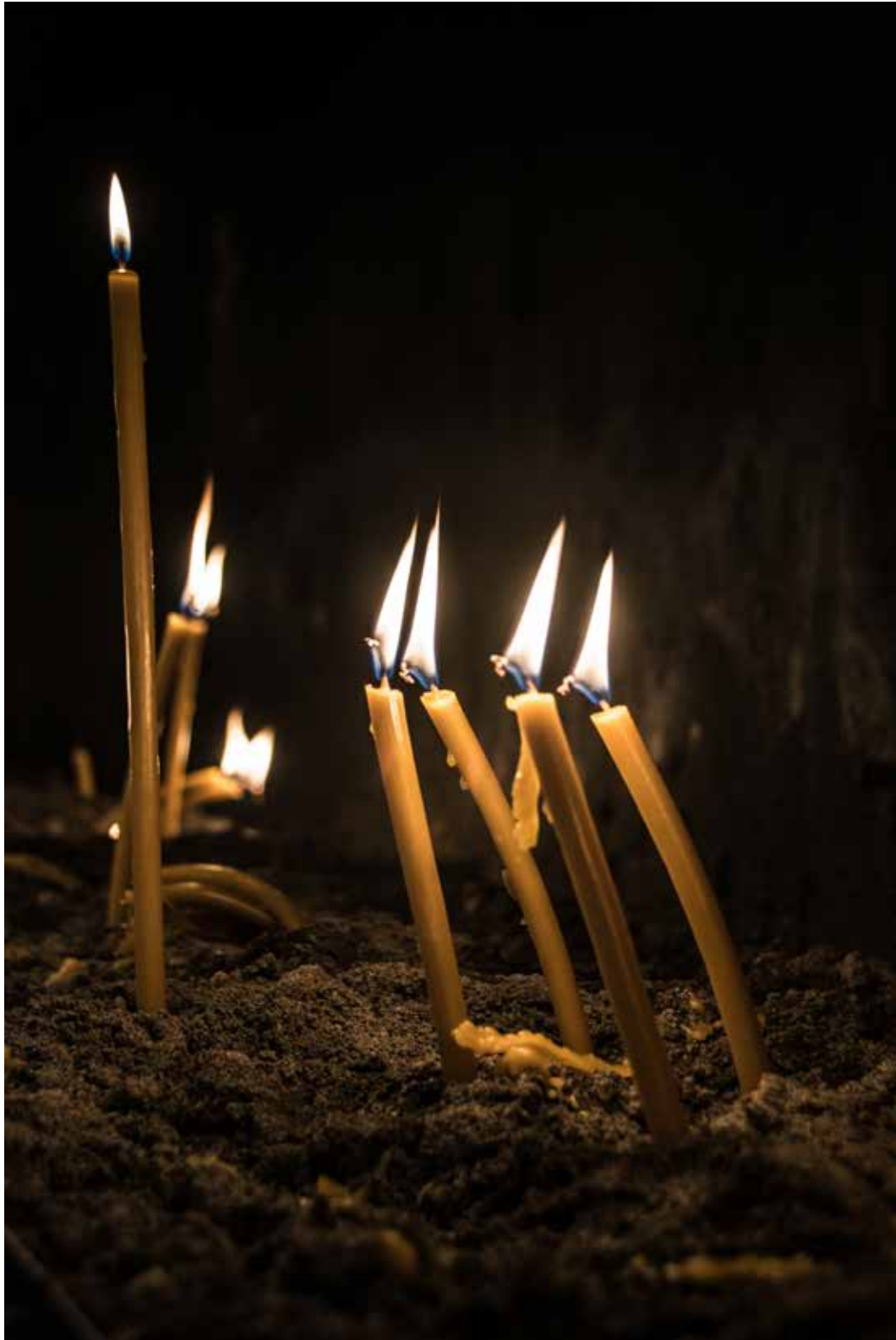
9. St. Nikola Church, Kotor, Montenegro (2016)