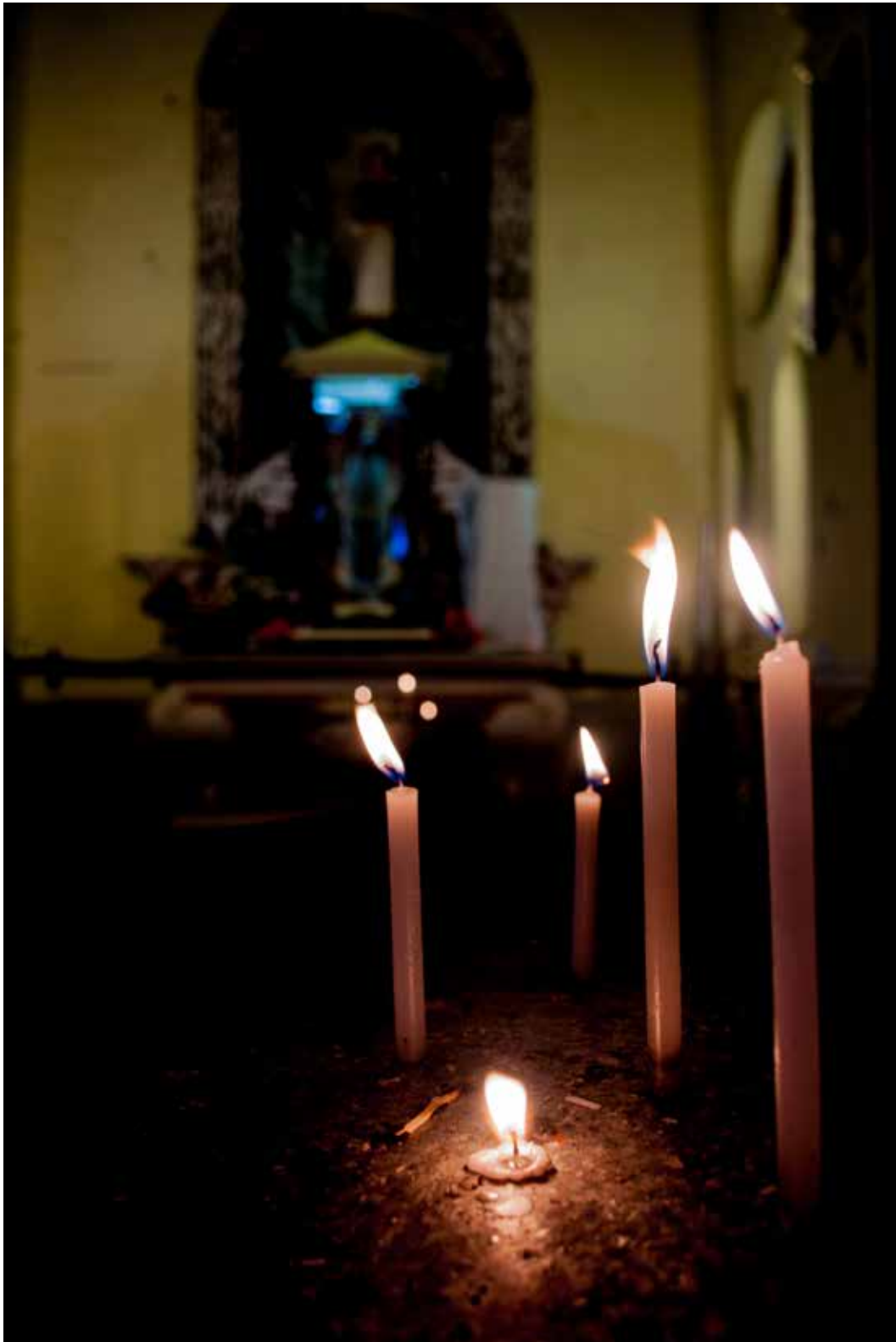
12. St. Francis Church, Kochi, India (2010)