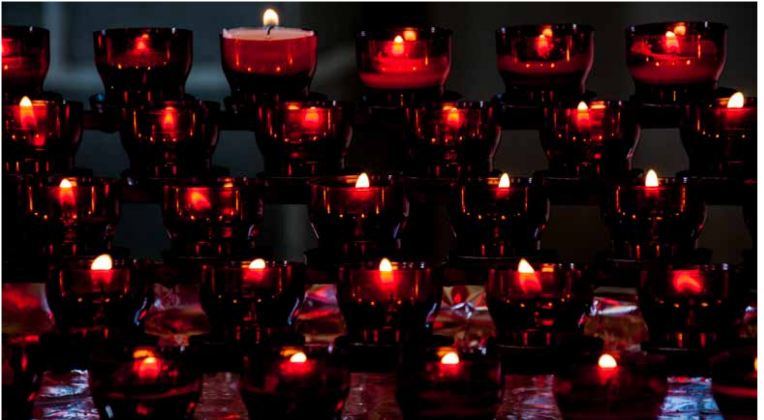
18. Bernhard von Aosta Chapel on the Gornegrat, Zermatt, Switzerland (2015)