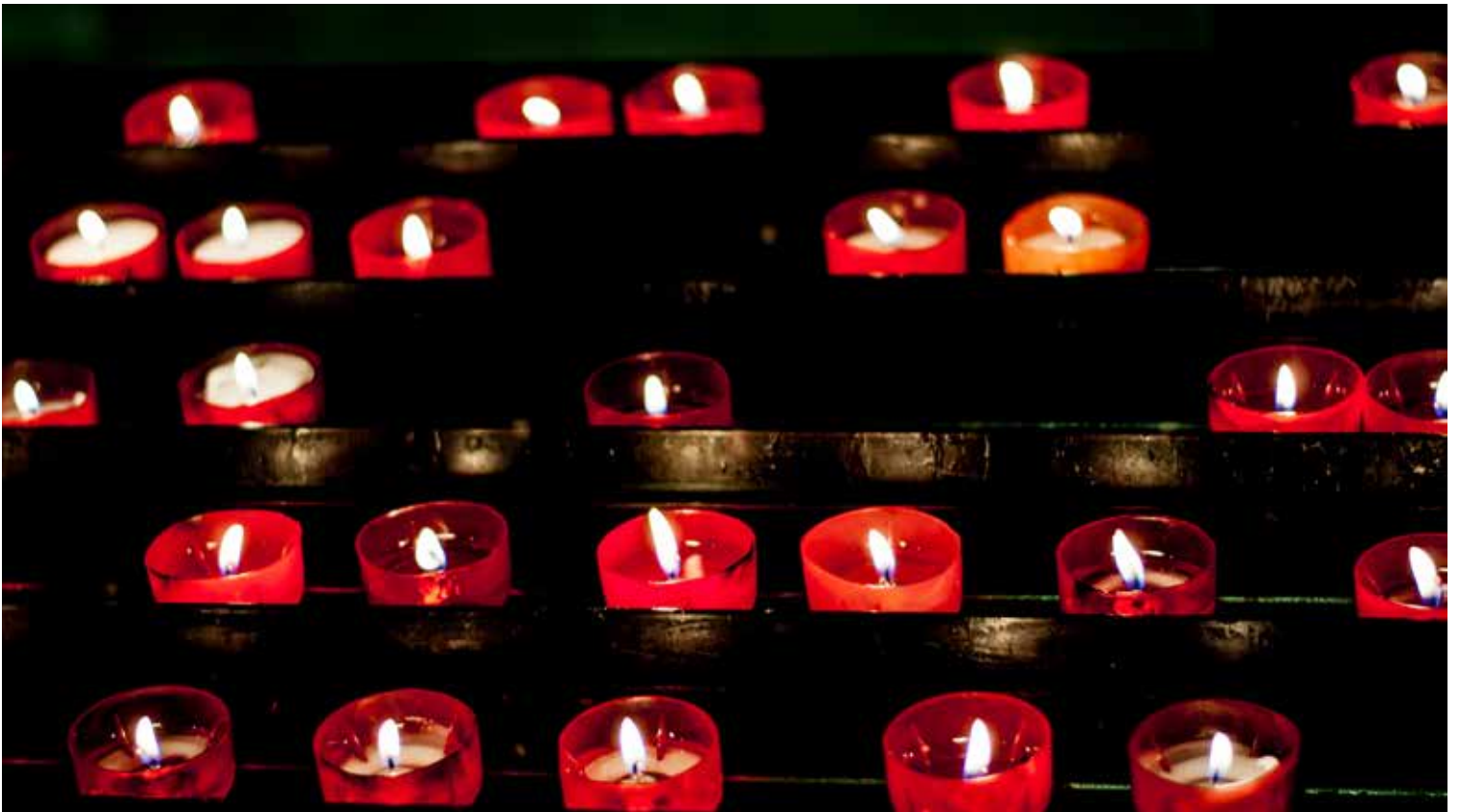
13. Lisbon Cathedral, Lisbon, Portugal (2013)