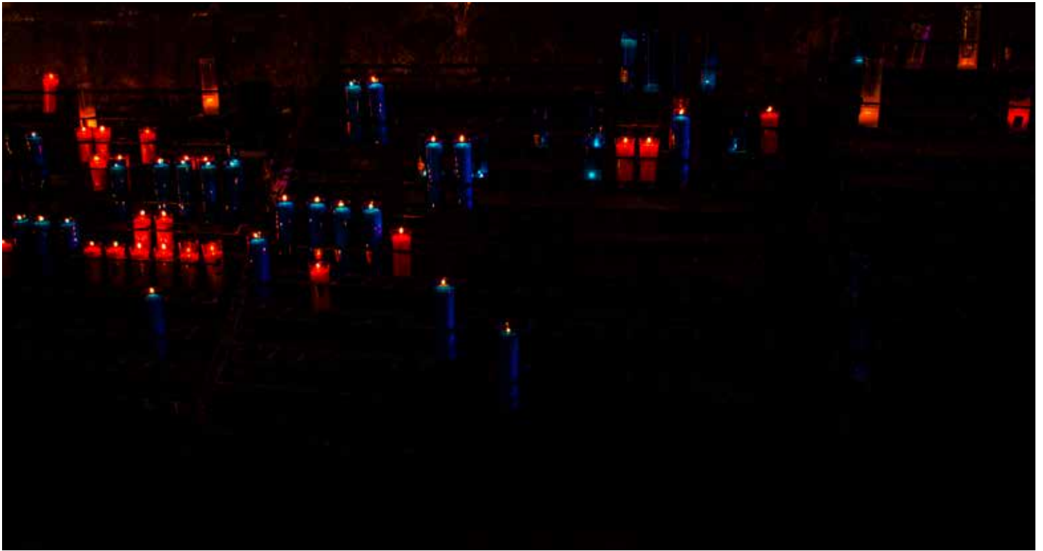
3. Santa Maria de Montserrat Abbey, Barcelona, Spain (2016)