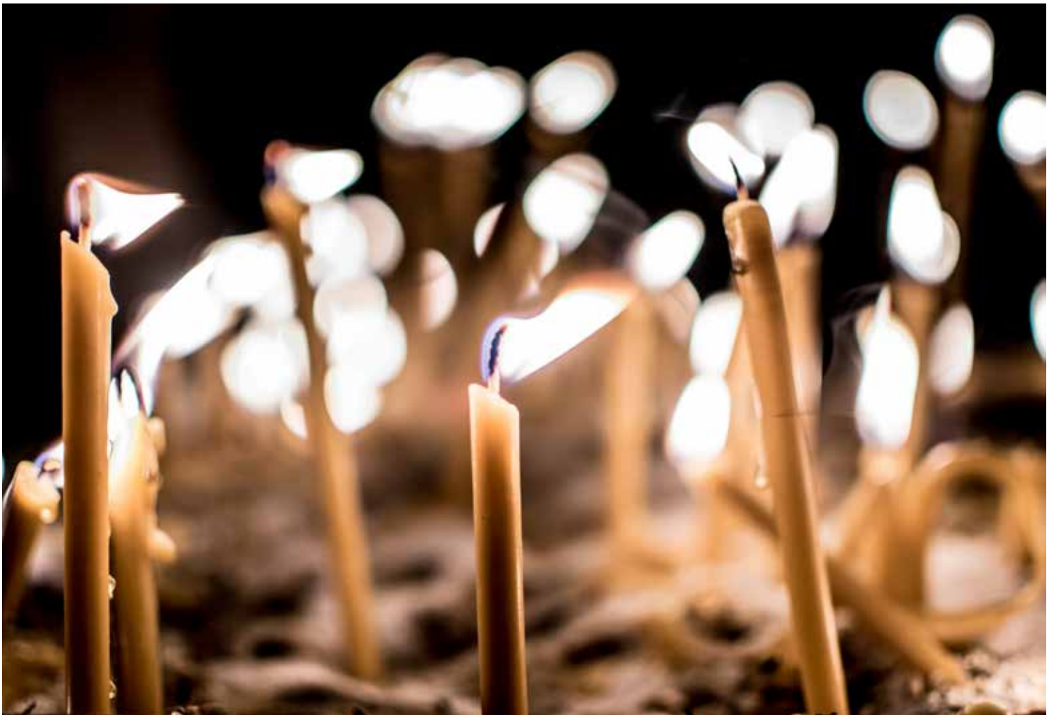
17. St. Stephen's Cathedral, Vienna, Austria (2016)