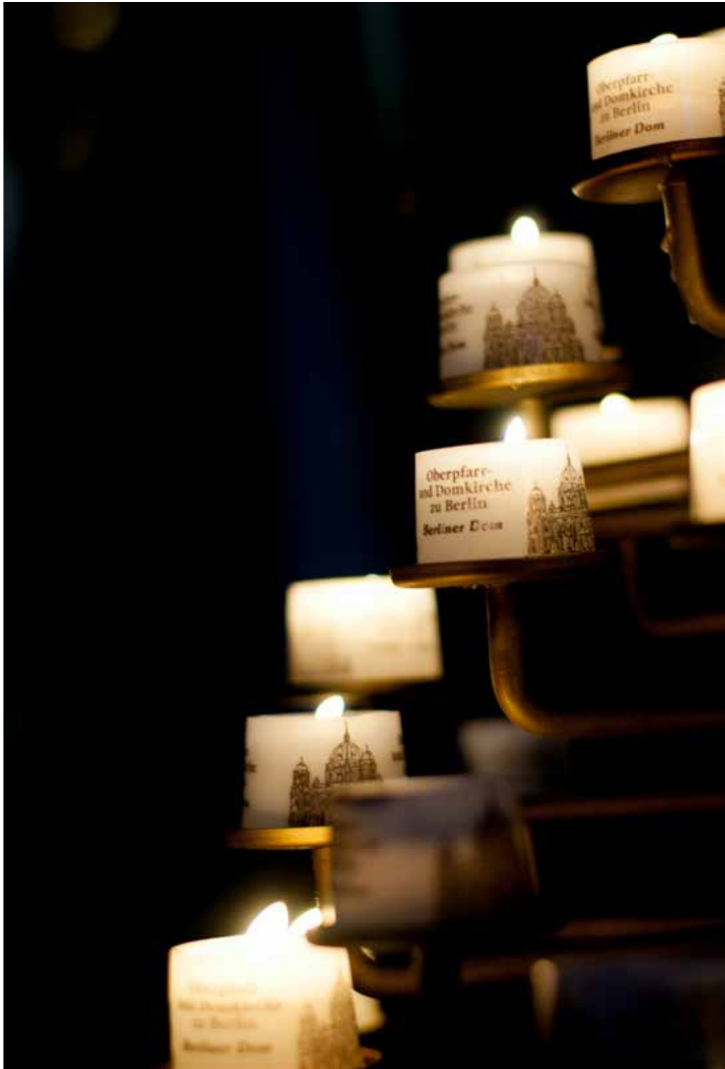
19. Berlin Cathedral, Berlin, Germany (2014)