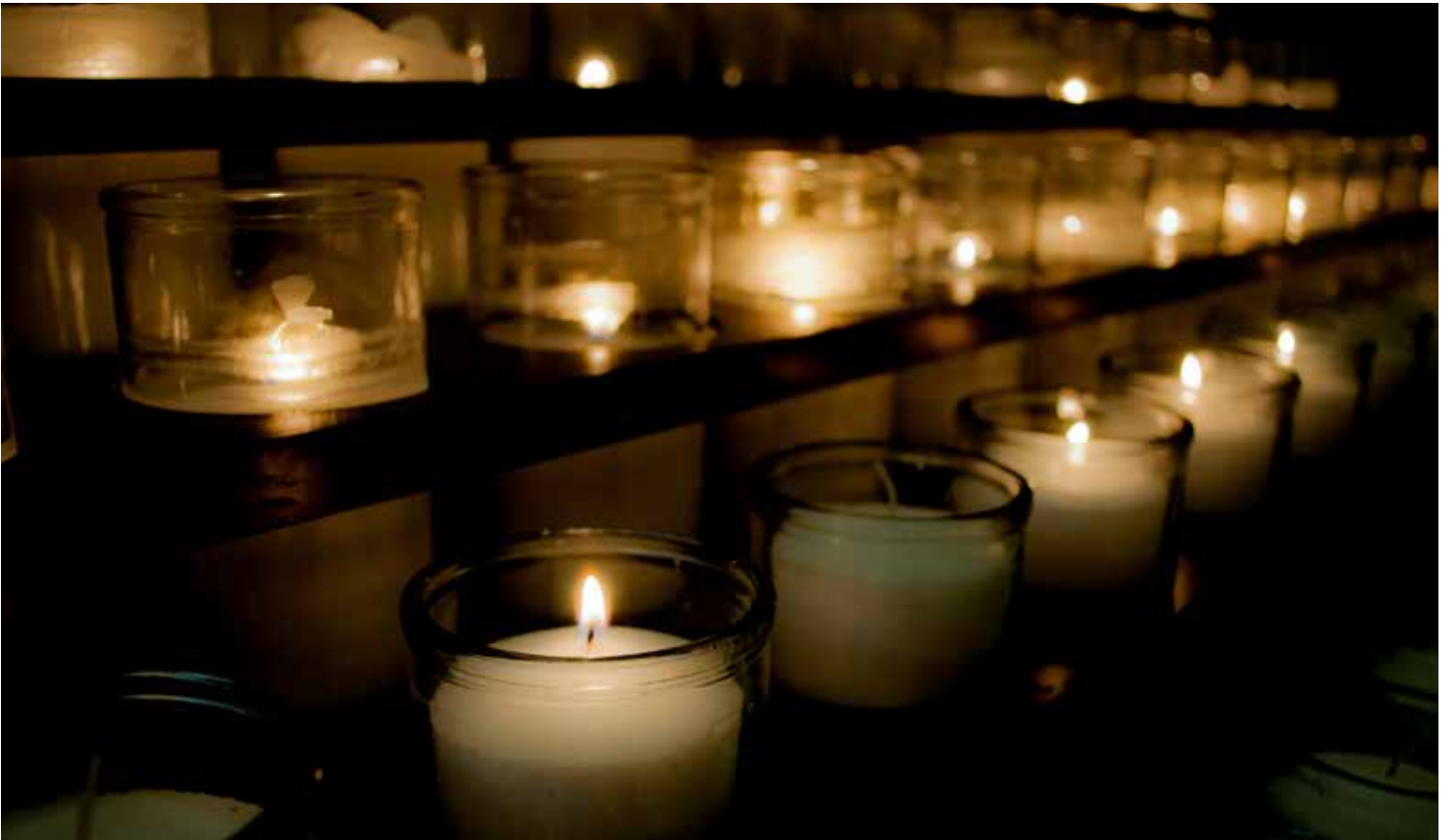
14. St. Louis Cathedral, New Orleans, USA (2012)