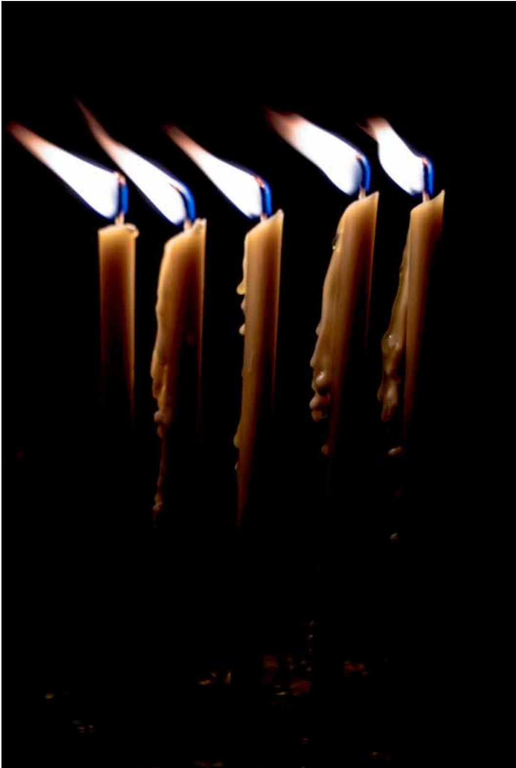
5. St. Nikola Church, Kotor, Montenegro (2016)