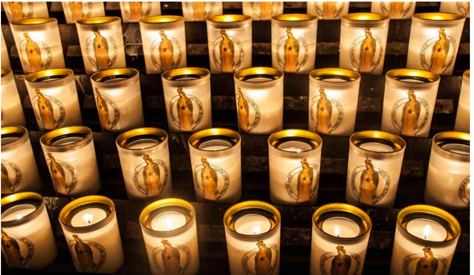
7. Notre-Dame Cathedral, Paris, France (2015)