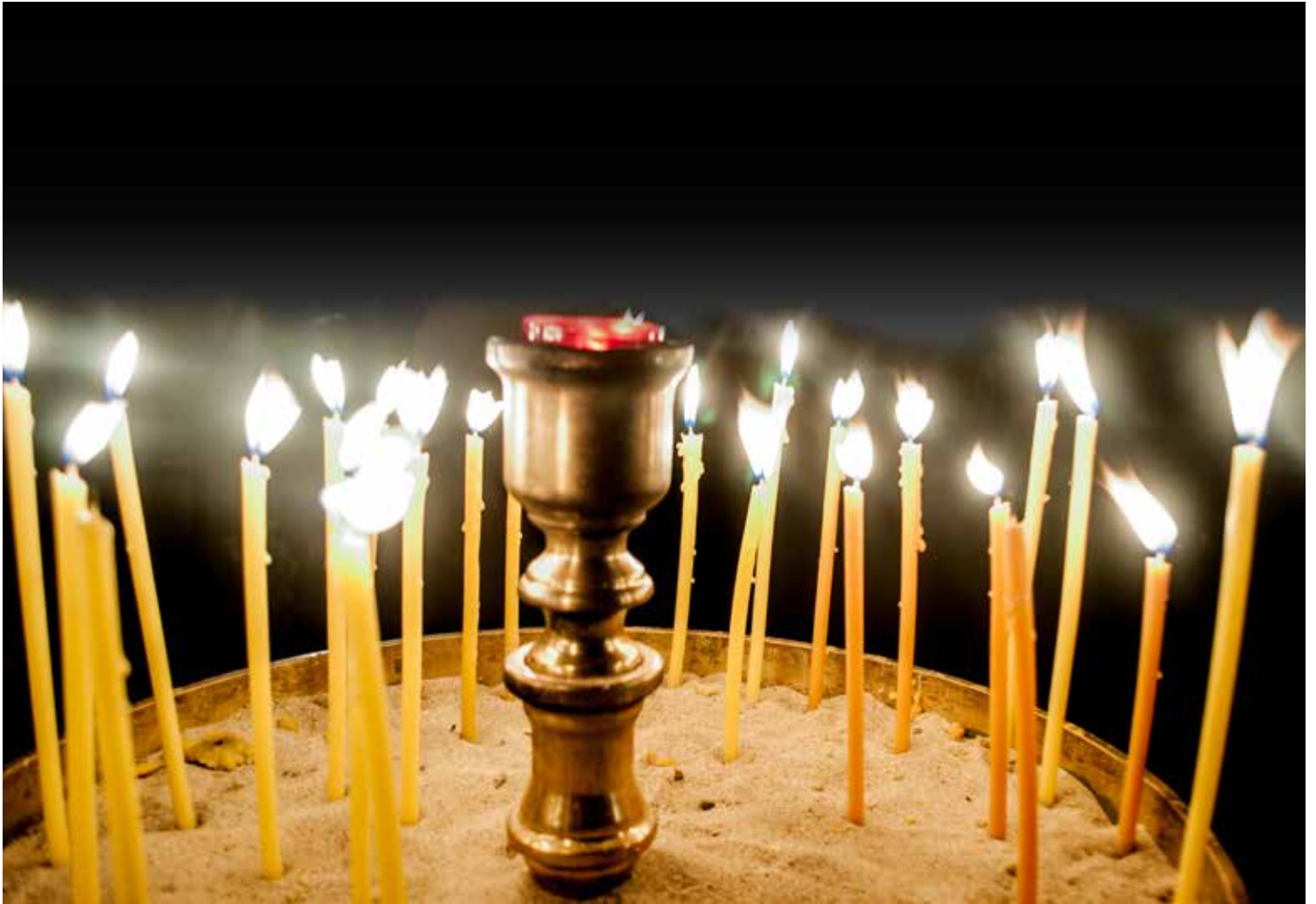
20. Sainte-Catherine Church, Brussels, Belgium (2012)