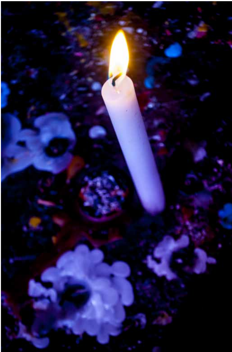
11. Metropolitan Cathedral of Quito, Quito, Ecuador (2014)