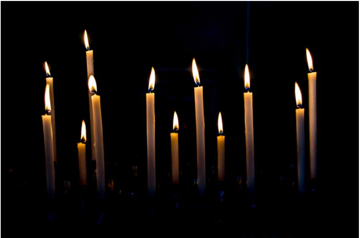
1. Church of the Eremitani, Padua, Italy (2016)