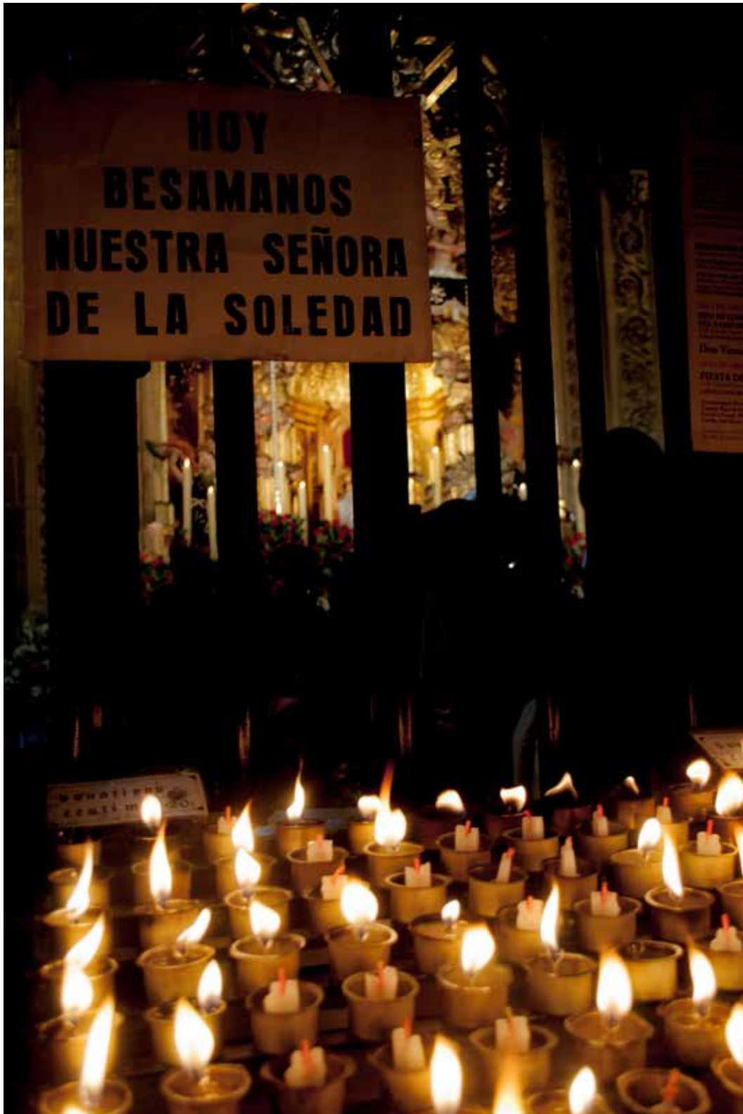
10. Salamanca Cathedral, Salamanca, Spain (2012)