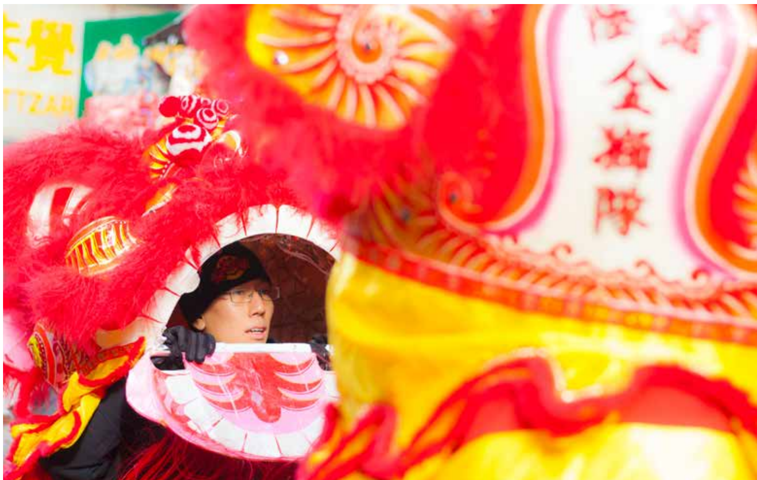
13. Inside the Dancing Dragon, New York City, NY, USA (2014)