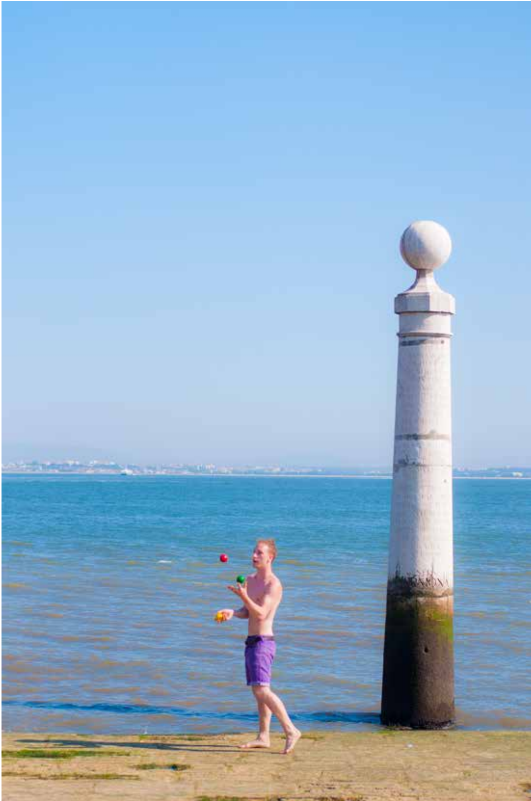
20. Juggling Backpacker, Lisbon, Portugal (2013)