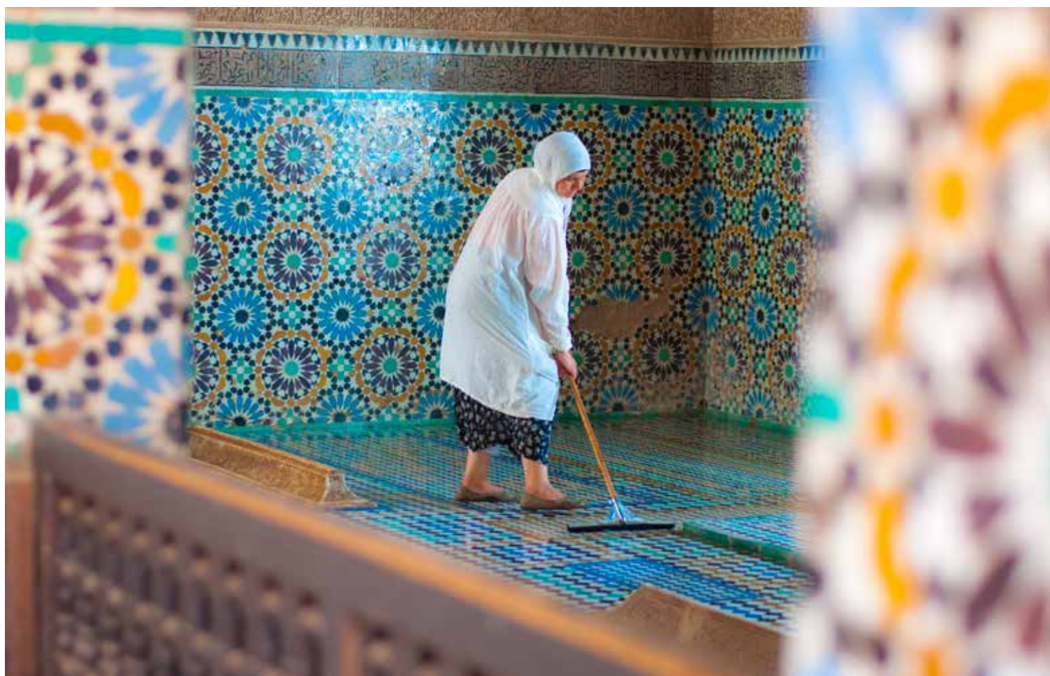
16. Mopping Bahia Palace, Marrakesh, Morocco (2013)