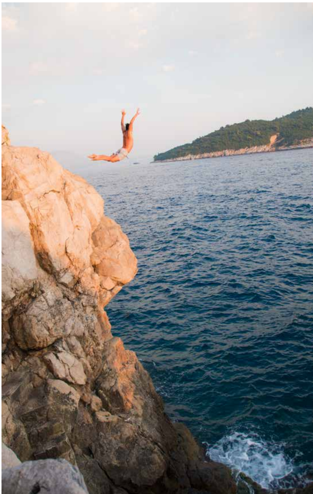
9. Cliff Diver, Dubrovnik, Croatia (2016)