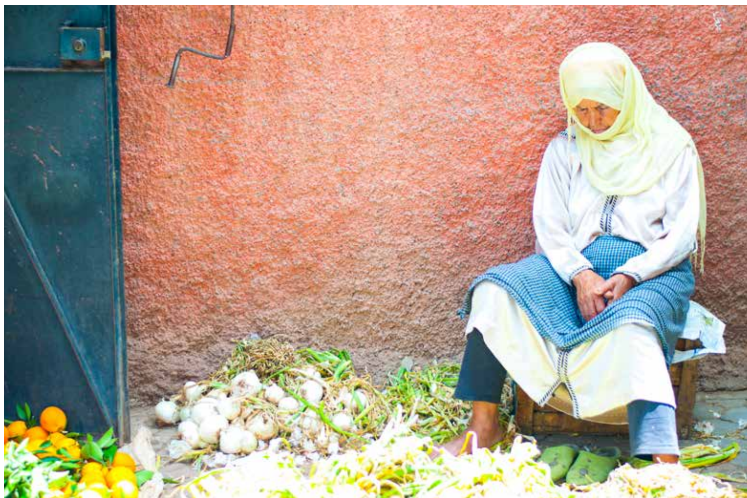
12. Market Snooze, Marrakesh, Morocco (2013)