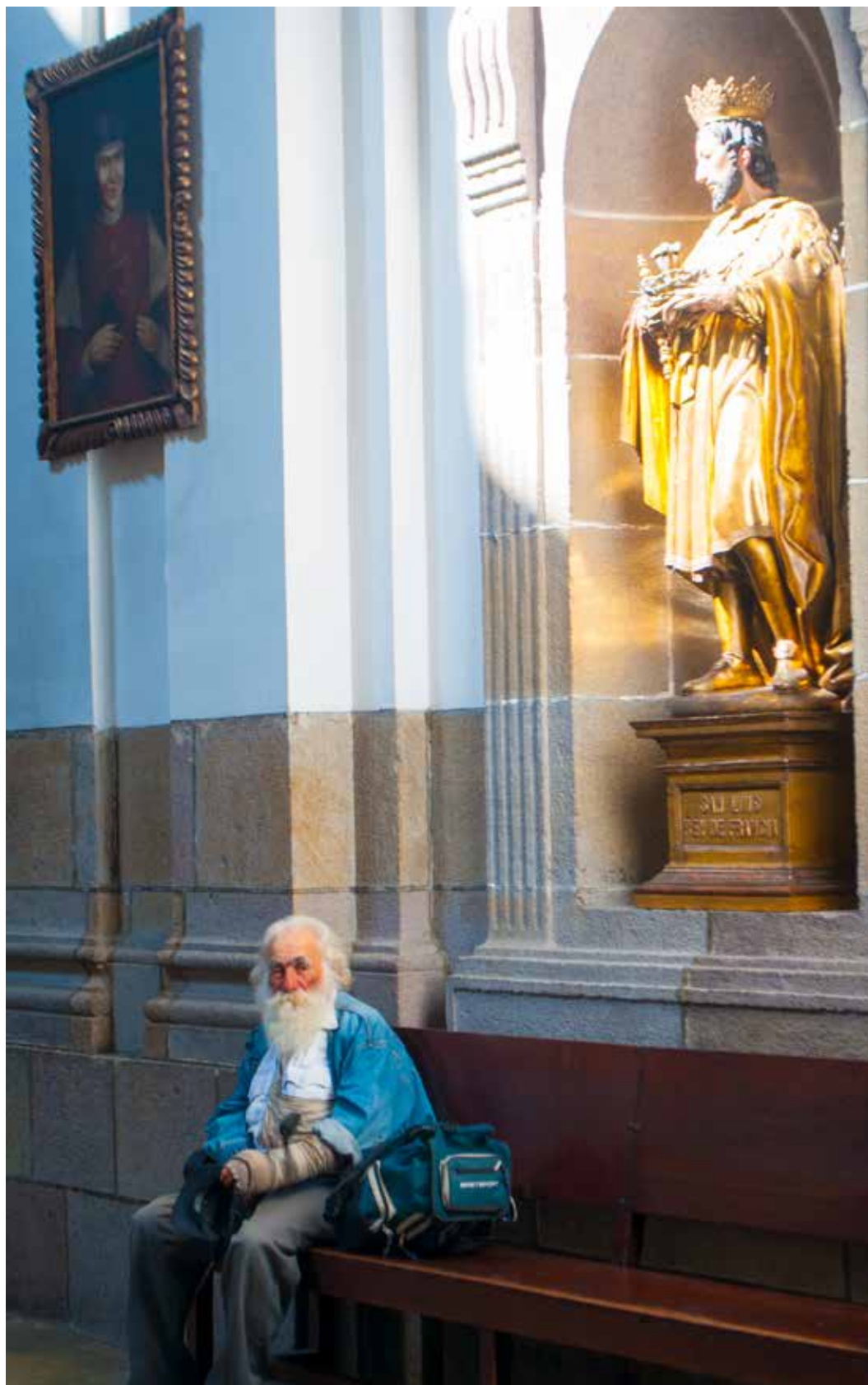
15. Spiritual Stranger, Guatemala City, Guatemala (2012)