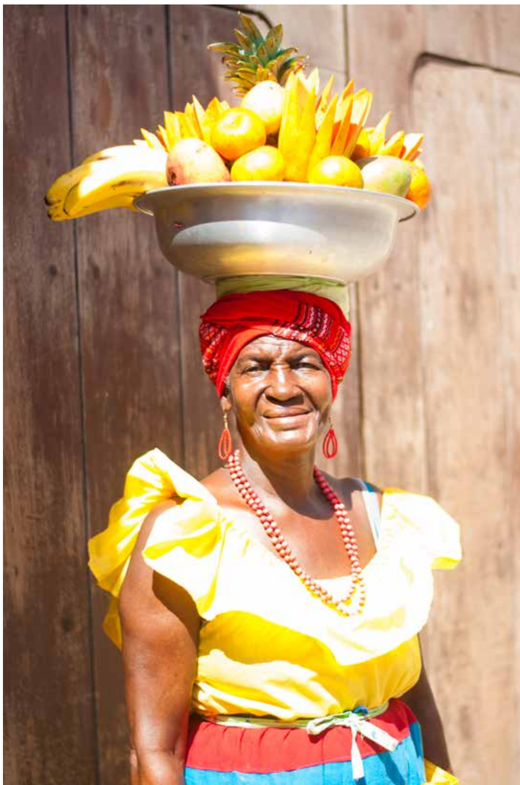
10. La Palenquera, Cartagena, Colombia (2014)