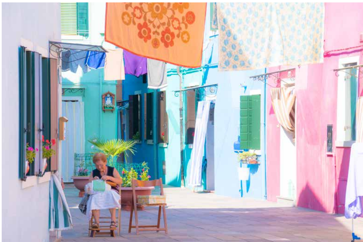
19. Lacemaker, Burano, Italy (2016)