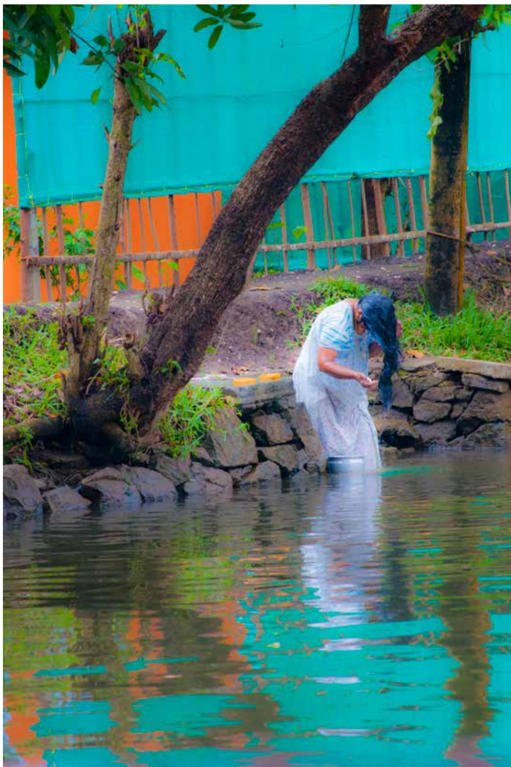
6. Bathing in Kerala Backwater, Alleppay, India (2010)