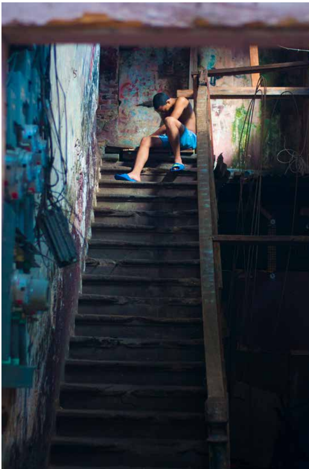
7. Staircase Solitude, Panama City, Panama (2015)