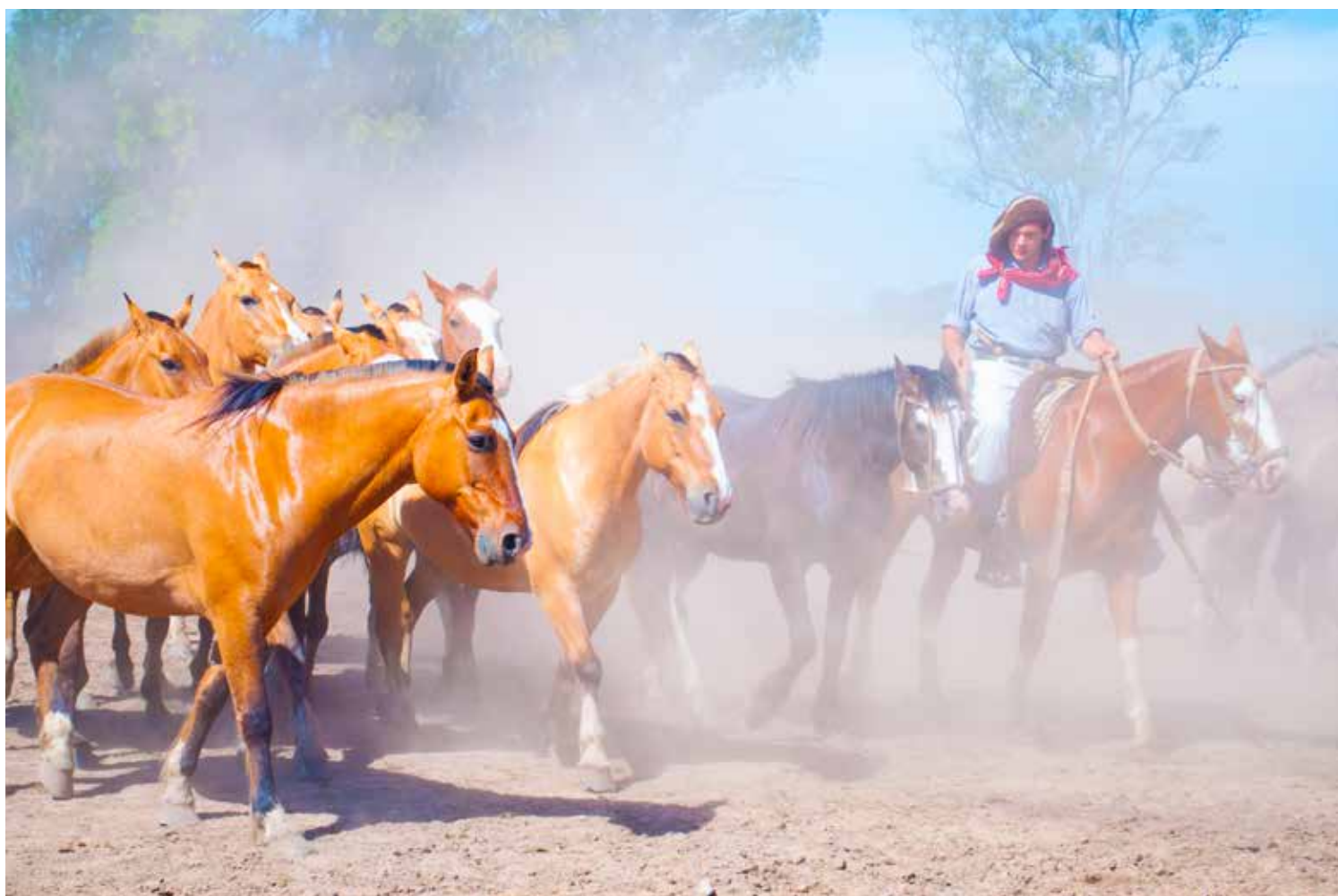
3. Gaucho of Estancia Santa Susana, Buenos Aires, Argentina (2012)