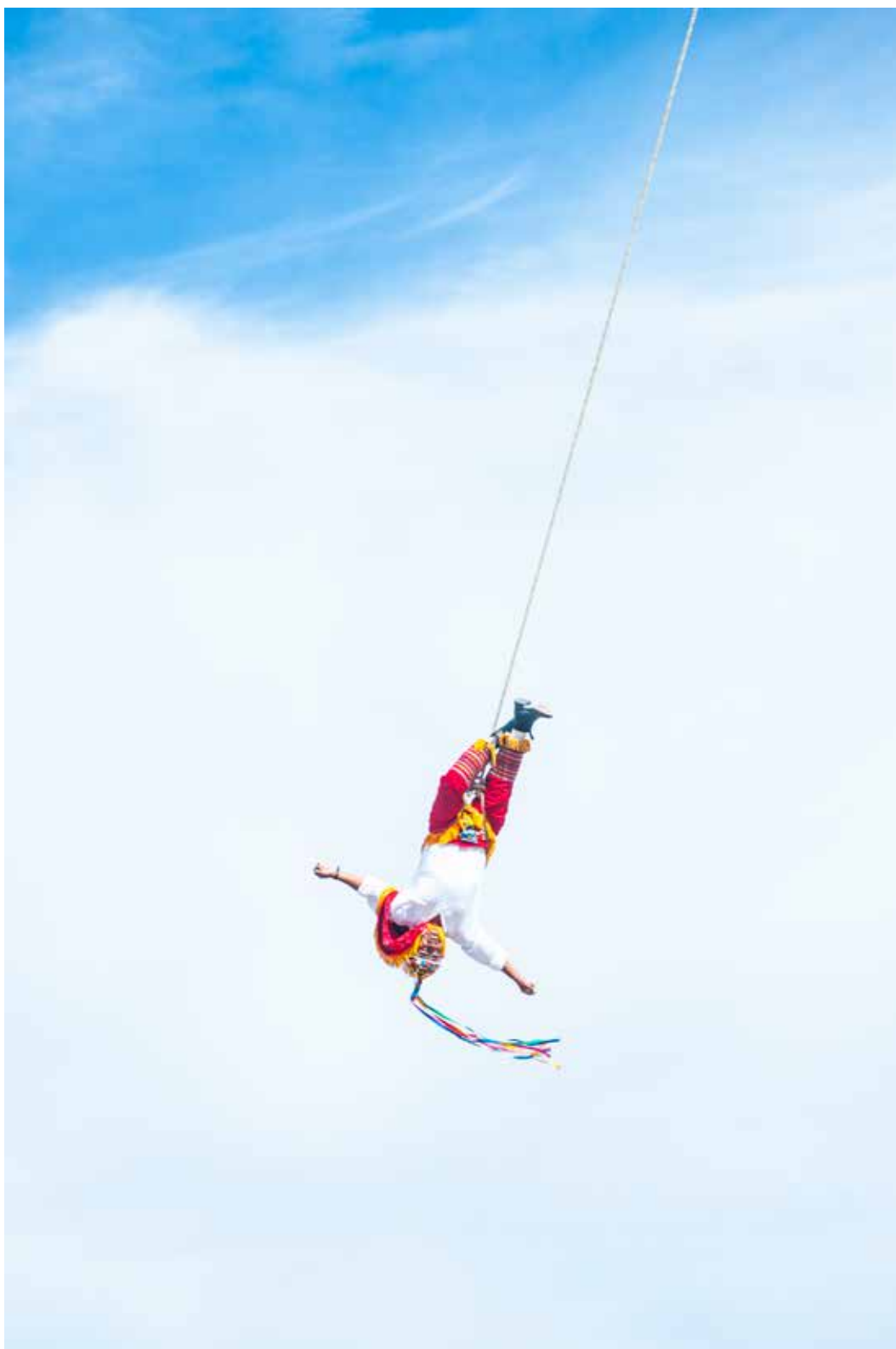
18. Aerialist, Puerto Vallarta, Mexico (2011)