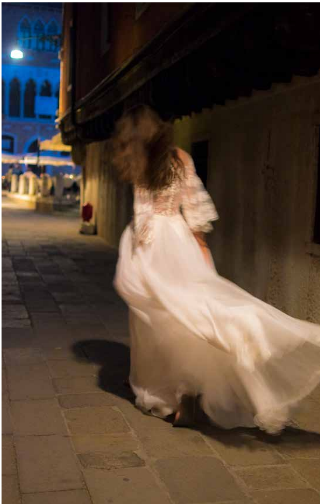
4. Bride or Model?, Venice, Italy (2016)