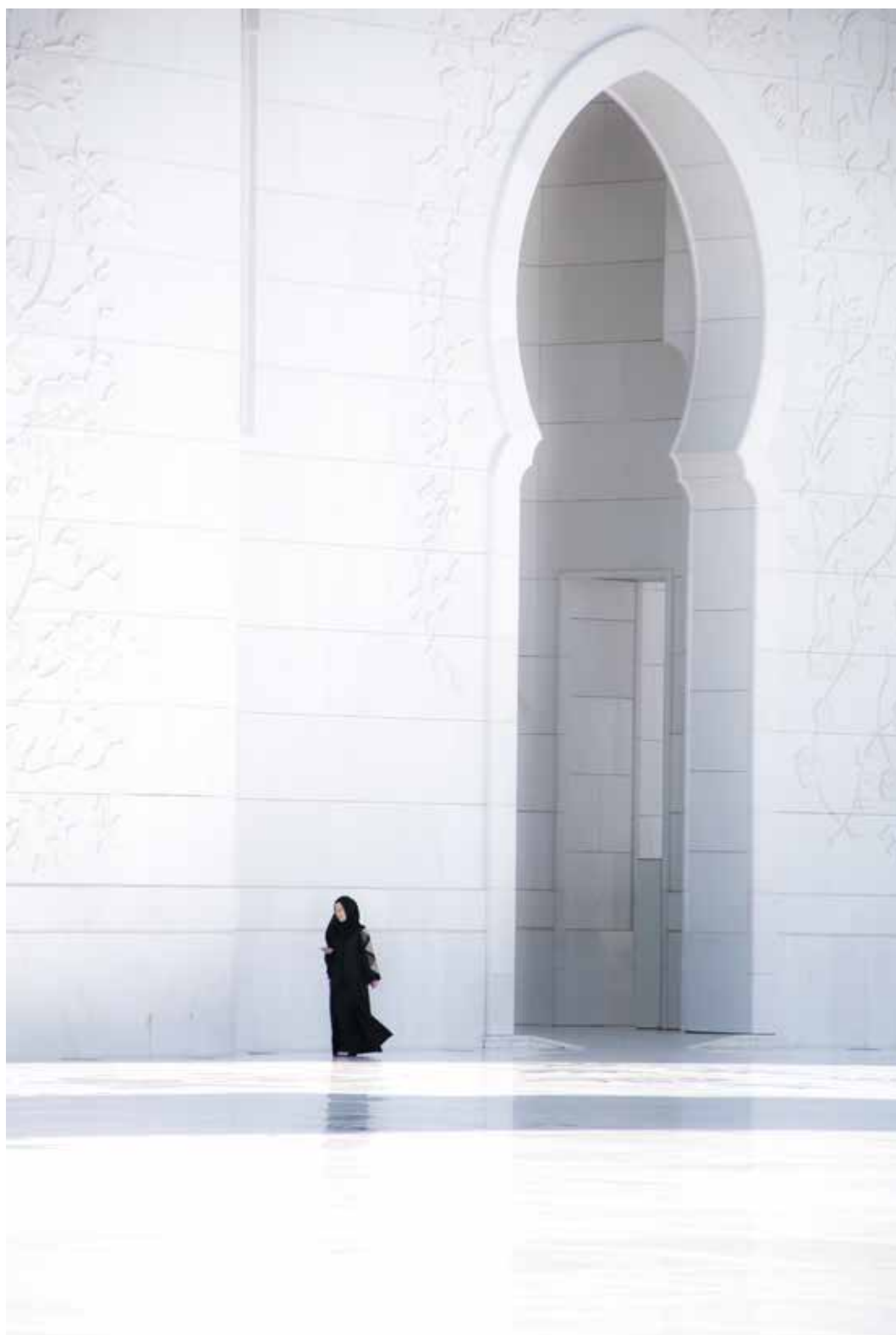
2. Walking Sheikh Zayed Grand Mosque, Abu Dhabi, United Arab Emirates (2016)