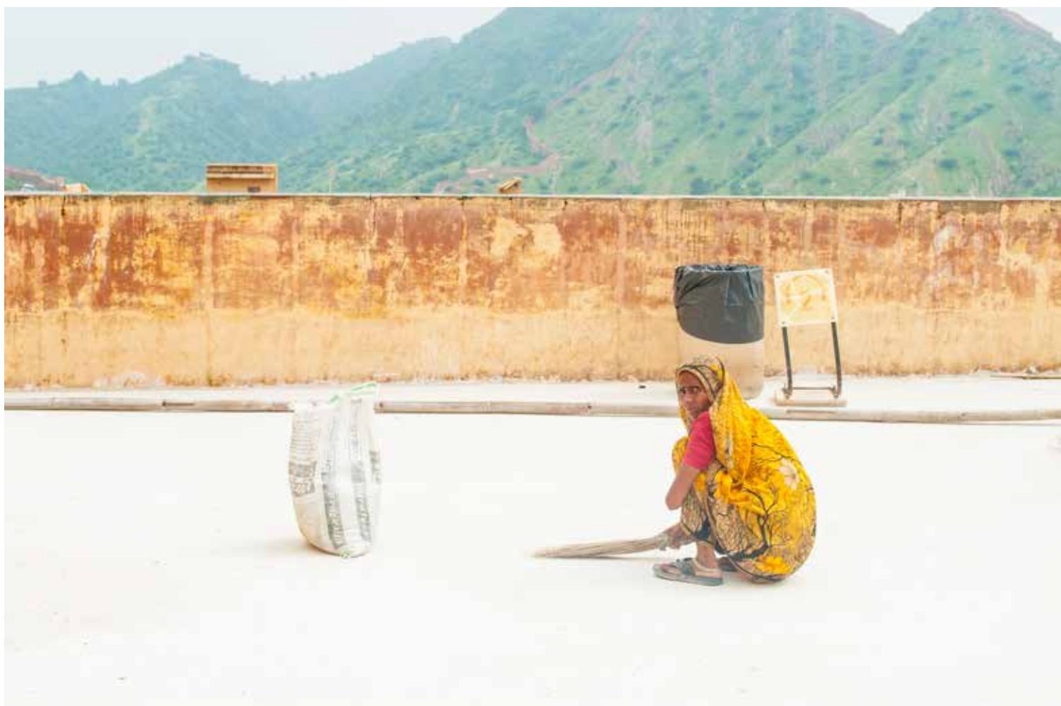
8. Brooming Amber Fort, Jaipur, India (2010)