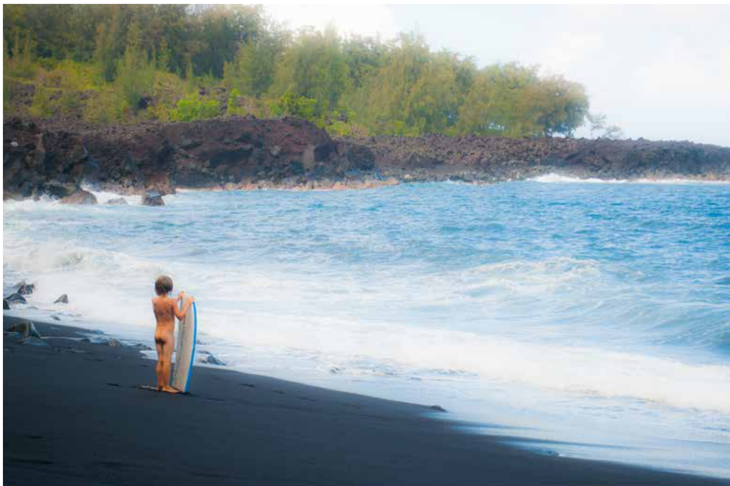
17. Boy Nudist on Kehena Beach, Hilo, Hawaii, USA (2013)