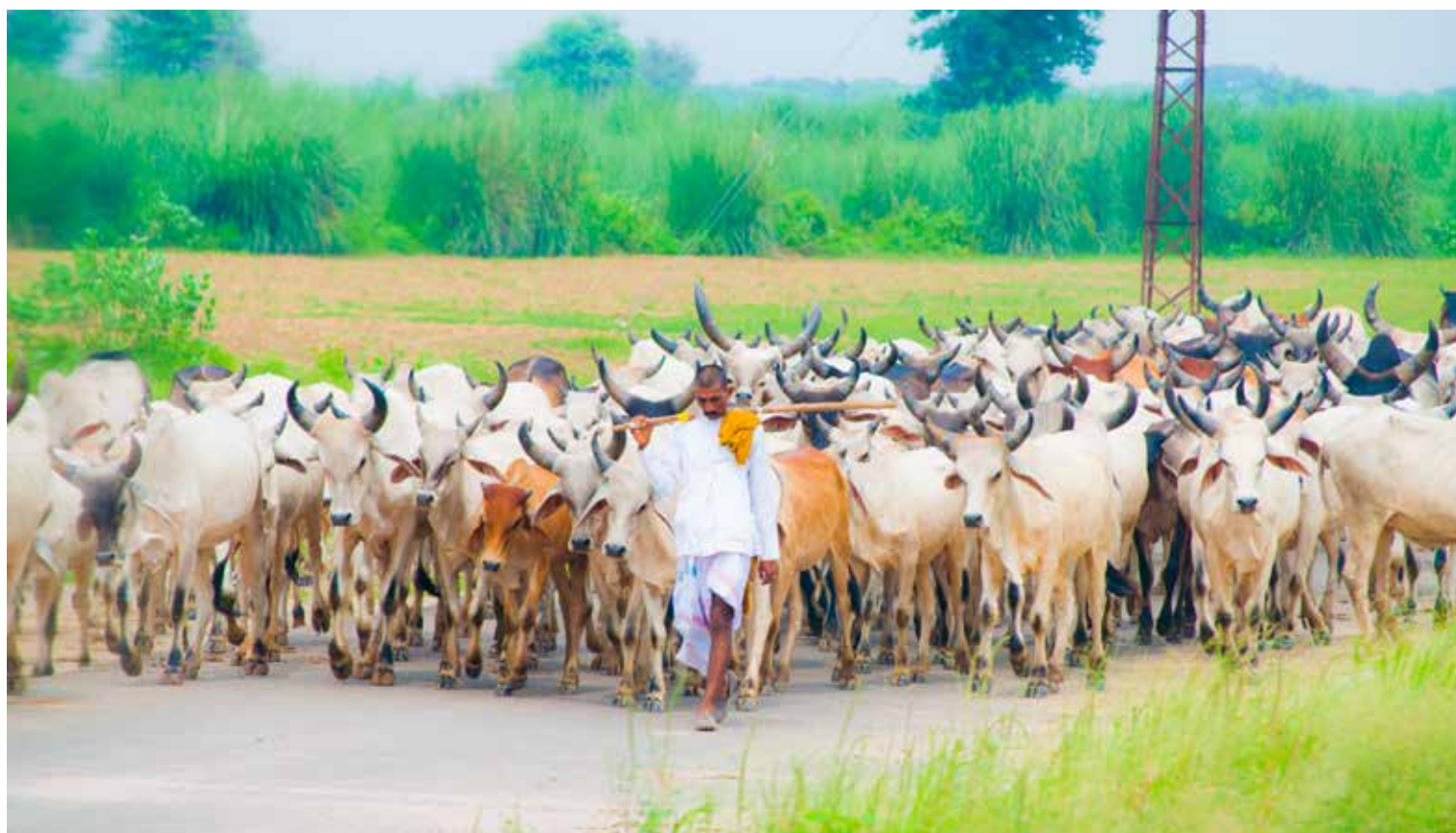
1. Herding, Jaipur, India (2010)