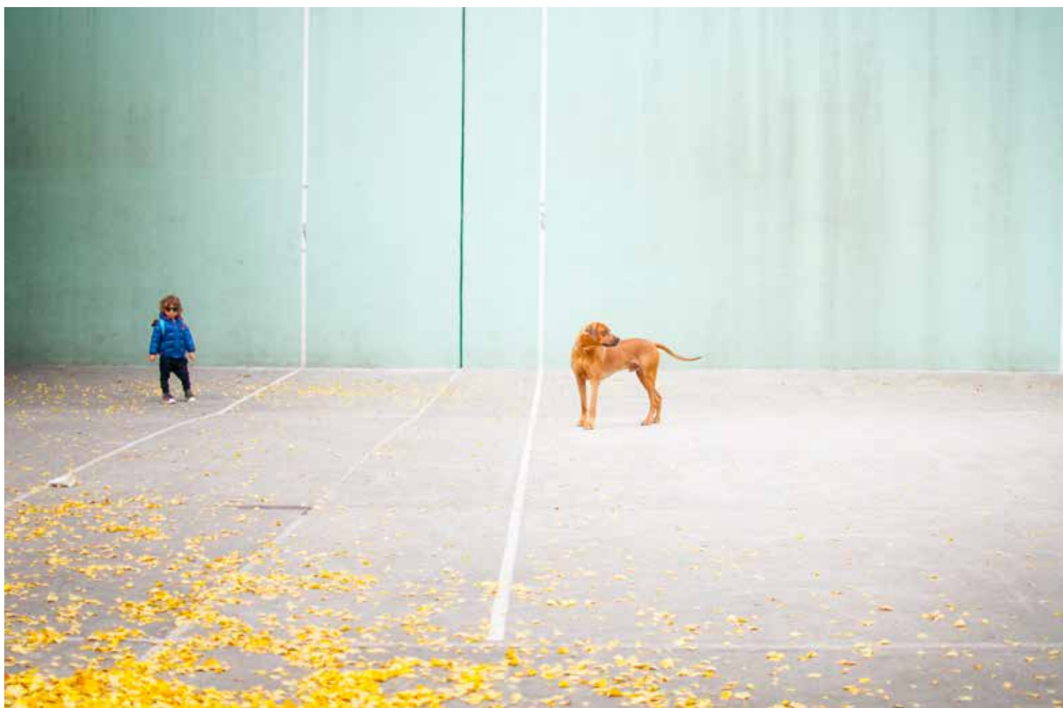
11. Boy and His Dog, New York City, NY, USA (2015)