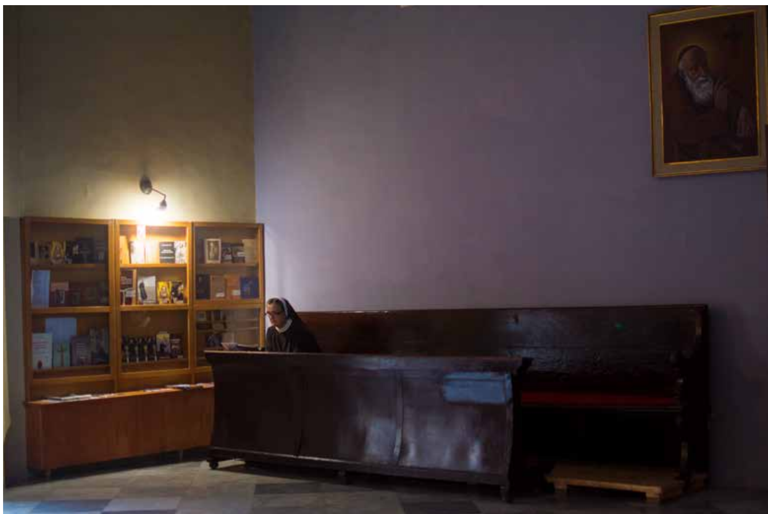
14. St. Savior Church Nun, Dubrovnik, Croatia (2016)